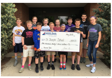
St. Joseph School was presented with a check for $133.00!

DeWitt Bank & Trust Co. is proud to support local schools through our Honor Roll Program. Each quarter, students who make the Honor Roll earn $1 for their school. For the 2016-2017 school year, we recognized 1,993 students who were named to the Honor Roll! Since the program began in 1989, DeWitt Bank & Trust Co. has donated more than $50,000 to area schools.