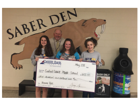
Central DeWitt Middle School was presented with a check for $602.00!