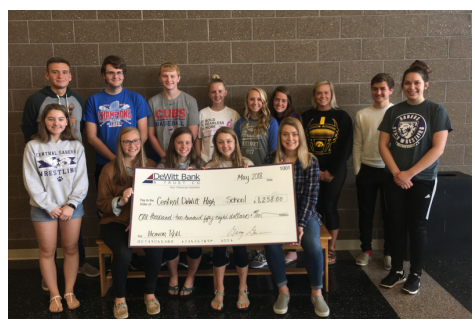
Central DeWitt High School was presented with a check for $1,258.00!