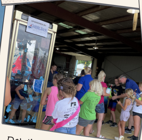
DeWitt Bank Money Grab Game at the Clinton Co. Fair