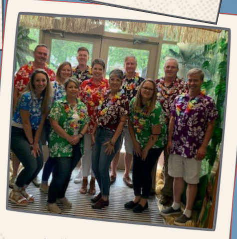
Wilton Bank Luau