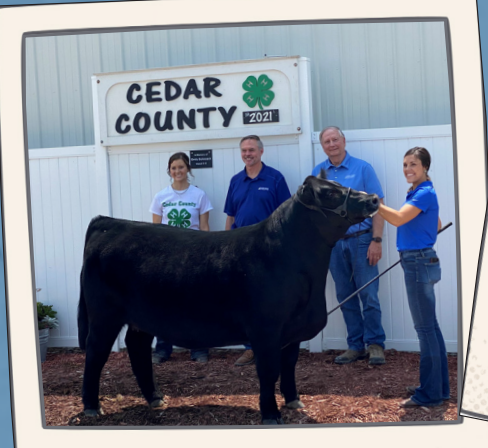
Adult Showmanship at the Cedar County Fair